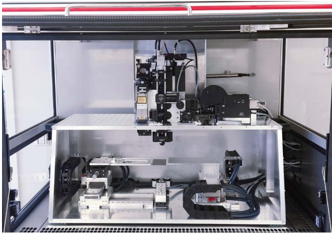
Image 2: With the new Raman LIFTSYS system (pictured here integrated into a workbench) for contact-free cell transport, various systems can be created for cell-based tests.

FRAUNHOFER INSTITUTE FOR LASERTECHNOLOGY ILT FRAUNHOFER INSTITUTE FOR APPLIED INFORMATION TECHNOLOGY FIT FRAUNHOFER INSTITUTE FOR INTERFACIAL ENGINEERING AND BIOTECHNOLOGY IGB