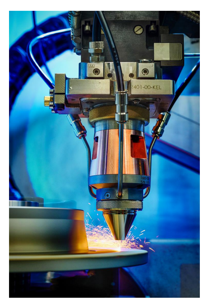
Image 1: Coating a brake disc with the EHLA process.