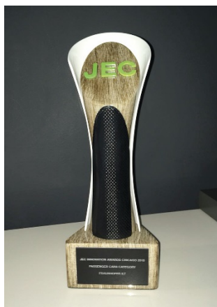
Image 1: On June 27, 2018, the development and manufacture of the hybrid roof bow received the "Future of Composites in Transportation 2018 Innovation Award" in Chicago.