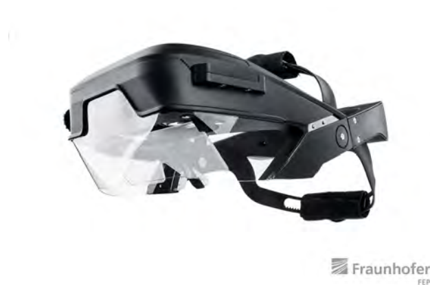
Figure 3: Prototype of the AR data glasses for industrial use, developed in the "Glass@Service" project

Picture in printable resolution: www.fep.fraunhofer.de/press