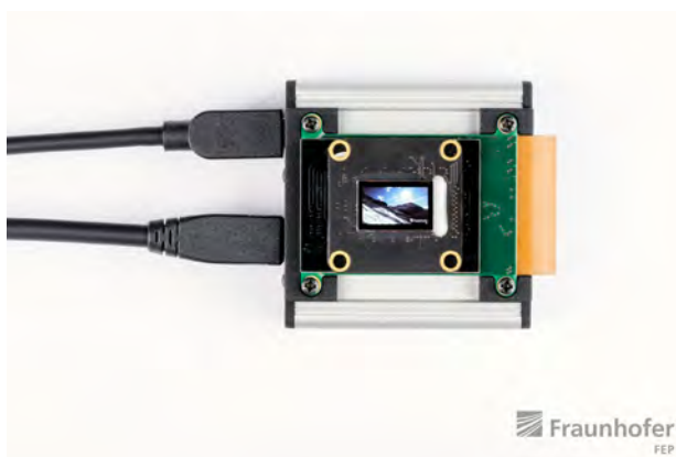
Figure 2: New OLED microdisplay with a resolution of 1280 x 720 pixels

Picture in printable resolution: www.fep.fraunhofer.de/press