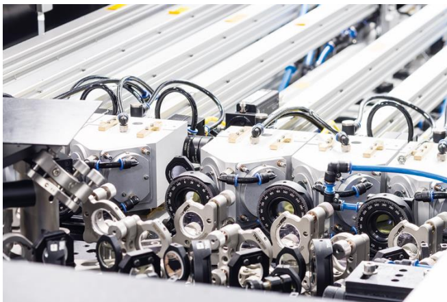
Image 2: Coherently combined USP fiber lasers of the kW class, as they are made available in the user facility at Fraunhofer IOF.